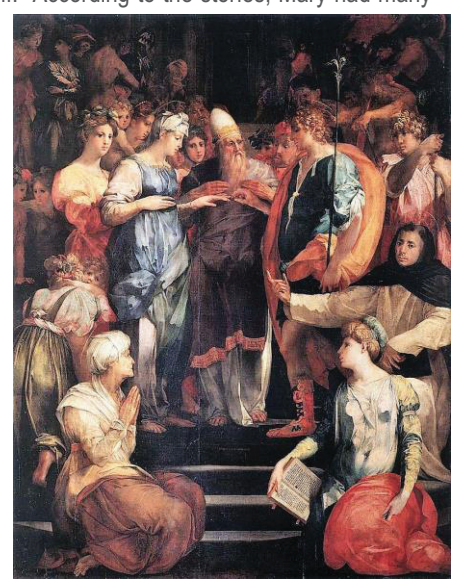
Rosso, Marriage of Virgin, talian, 1523, Florence, San Lorenzo

In the scene of the wedding of Mary and Joseph he carries his lily topped rod as a symbol of his own purity and as the sign of divine appointment as foster father for Jesus.